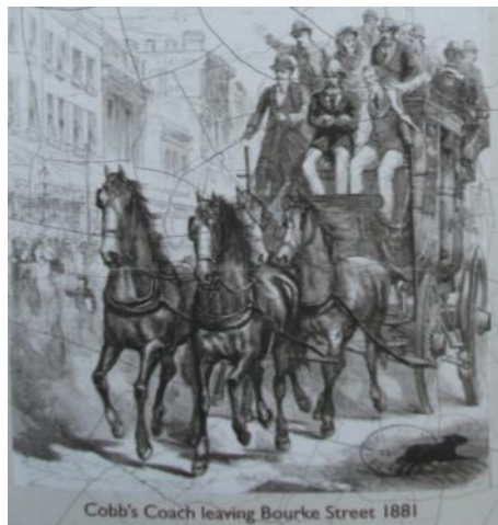
Cobb's Coach leaving Bourke Street 1881

Another story board recounts the history of the Western Port Cobb & Co.