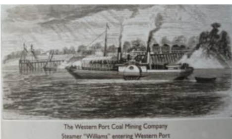
The Western Port Coal Mining Company Steamer "Williams" entering Western Port