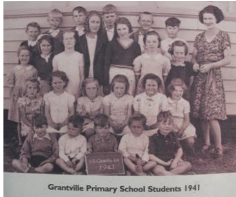
Grantville Primary School Students 1941

One of the story boards tells of the history of the Grantville State School, No. 1414