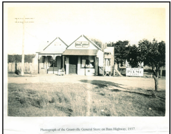
Photograph of the Grantville General Store on Bass Highway, 1937.

Email: leader@grantvillehistory.com.au or phone 0410 952 932 (Leave message if office unattended )