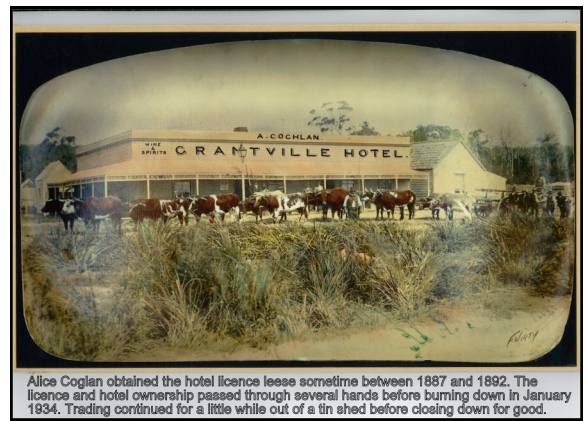
Alice Cogan obtained the hotel licence lease sometime between 1887 and 1892. The licence and hotel ownership passed through several hands before burning down in January 1934. Trading continued for a little while out of a tin shed before closing down for good.